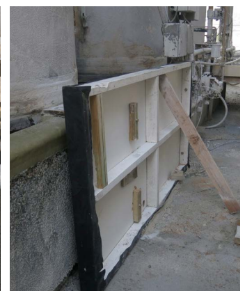
ArmaGrout used to rehabilitate concrete before protective coating applied. Replacement steel reinforcing was added to structural concrete column (left) before ArmaGrout pour. Leaking concrete chemical bund wall (right) sealed and restrengthened using ArmaGrout.